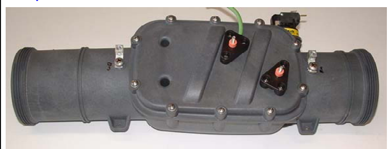
Tested and Approved by ETL per UL 1563.

The heater manifold assembly passed the UL test and only allowed 1.8 milliamps of current leakage through the spa water as tested by ETL.